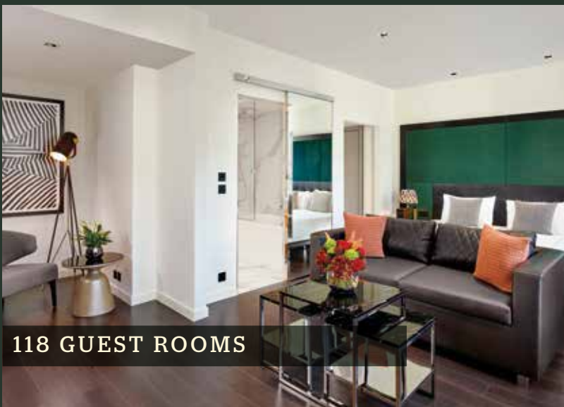
118 GUEST ROOMS