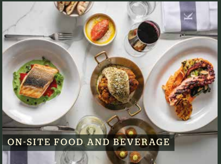
ON-SITE FOOD AND BEVERAGE