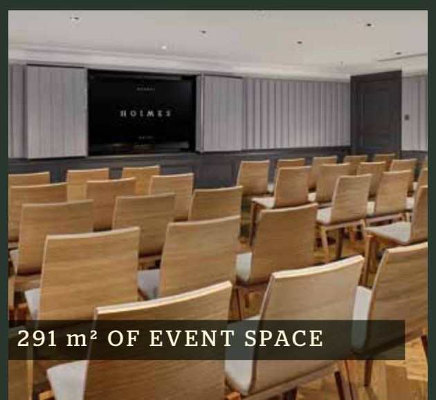
291 m 2 OF EVENT SPACE