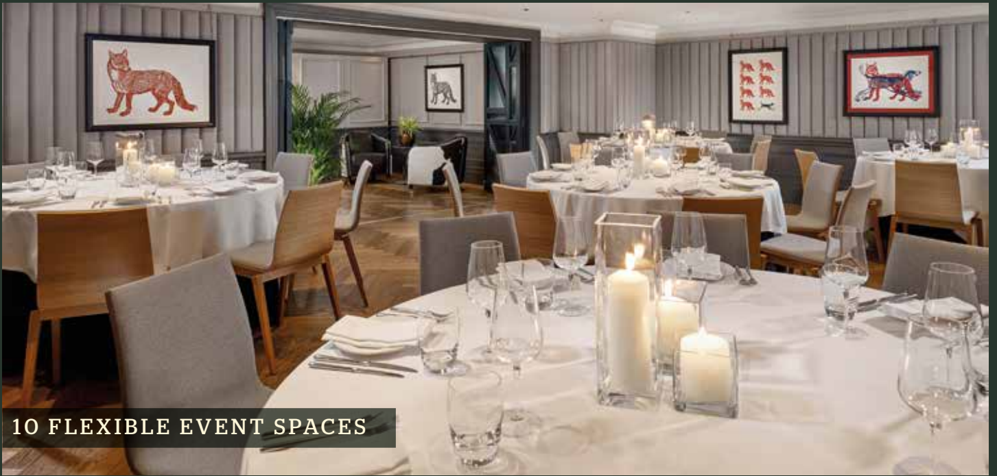
10 FLEXIBLE EVENT SPACES